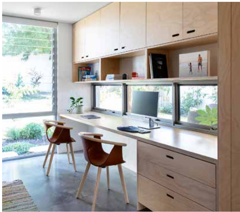
top left A generous and inviting activity area is used for homework and music practice, and can double as a home office. right A secluded, elevated outdoor room offers long views over the street. bottom left Stejskal's designs often incorporate meticulously crafted joinery, as in this entryway. right Michel Ducaroy's "Togo" couch is right at home in the north-facing living room. opposite Decks and balconies, low fences and an open carport create a welcoming home that connects readily to its surroundings.