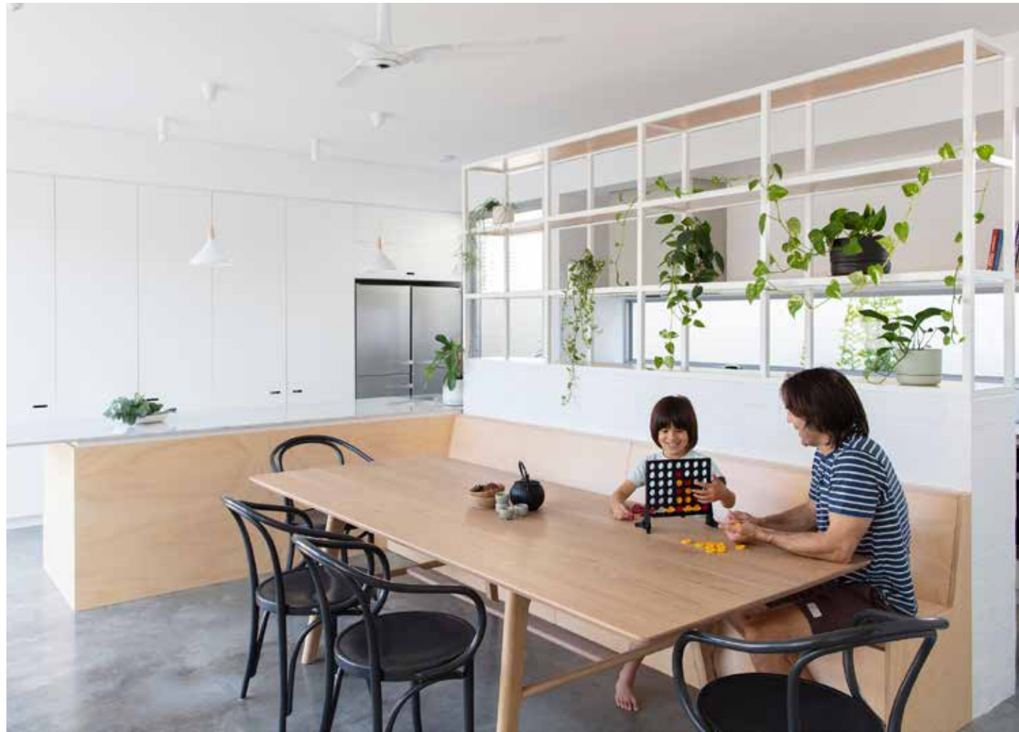
Open shelves discreetly screen the kitchen's work area while allowing the cook to remain part of the action. opposite Arranged as a series of stepped platforms and outdoor 'rooms', the garden is at one with the home's living areas. Local Donnybrook sandstone is warm underfoot, and an outdoor fireplace and sheltered seating area encourage venturing out almost year-round.

Bedrooms are located at either end of the house, with a master bedroom, ensuite and study at the front and two more bedrooms, an activity room and a bathroom at the rear. The nook-like sleeping areas for the two boys were bigger in the original design but reduced at the request of Anh, who chose instead to enlarge the adjacent activity area for homework, playing music and working from home. Custom-built joinery in the bedrooms creates a cosy, cabin-like feel and helps keep the small spaces organised.