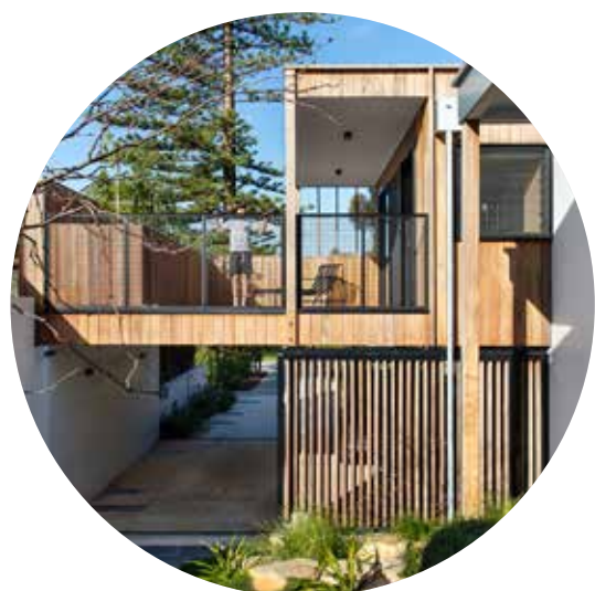
Placing a deck on top of the garage roof transforms empty space into a secluded spot to take in the street life and sea breeze.